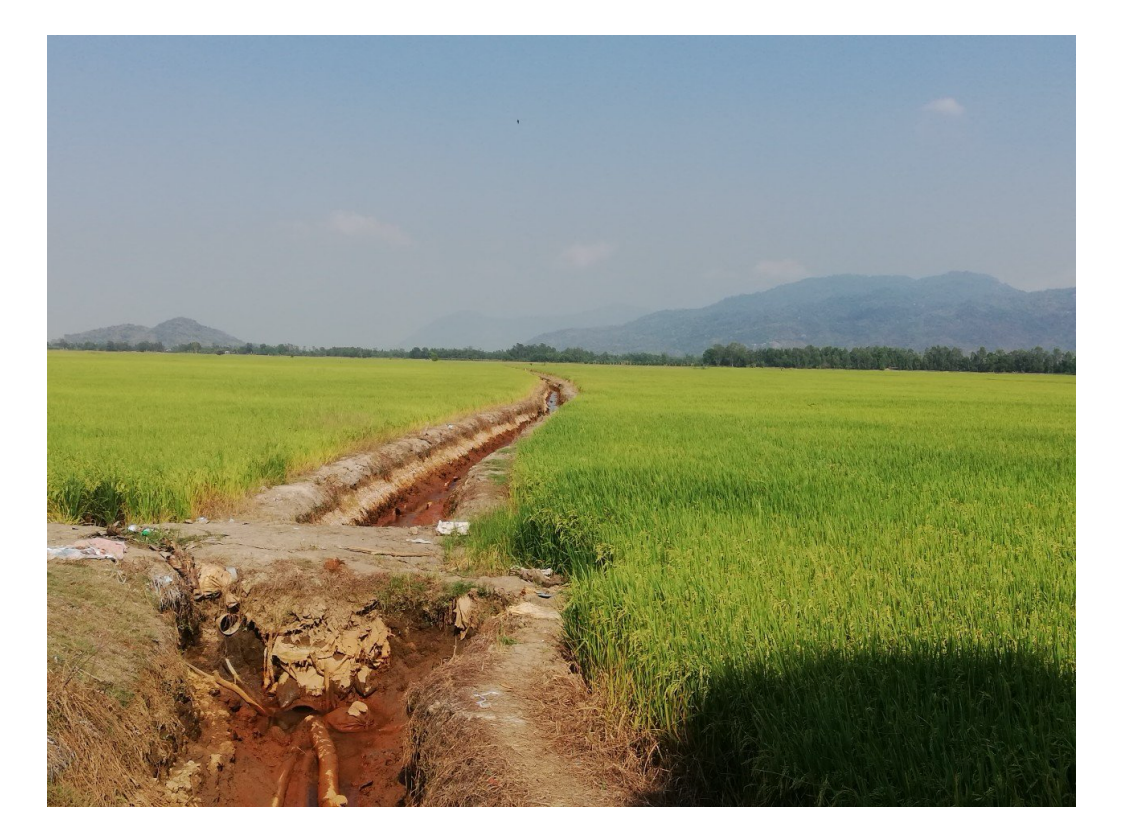
Figure 3 - Dry canal menaces the blooming rice fields