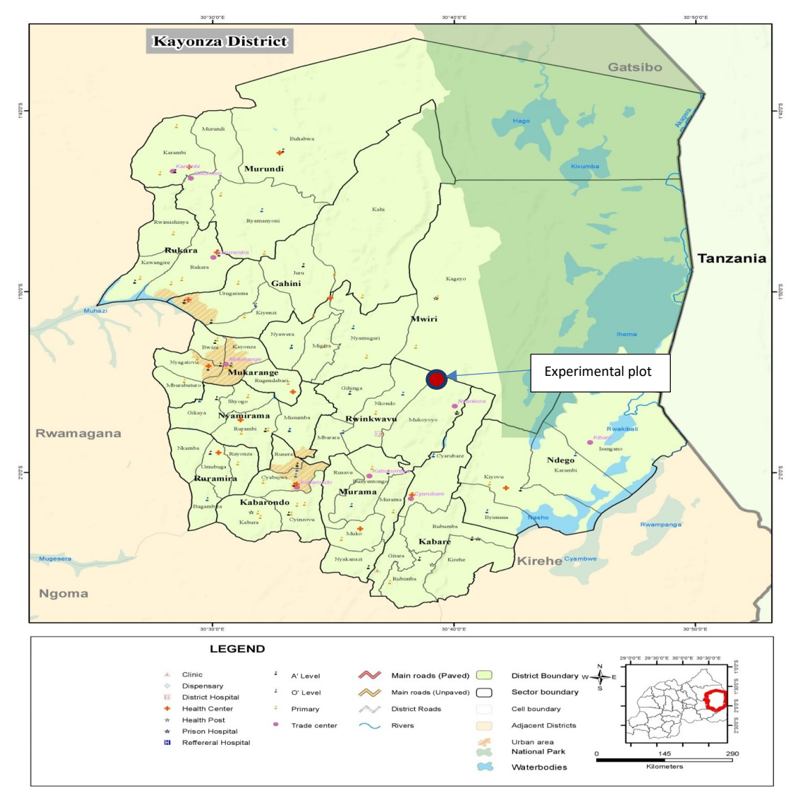
Figure 1. Location of Mwiri sector, Kayonza District (File: Kayonza district map. Source: Wikimedia).