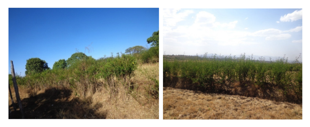
Figure 1 - Improved forages in soil and water conservation structure at the study area.

all of the respondents practice improved forage plantation on their soil and water conservation bunds. Whereas small proportion of backyard forage development, 5% (Ariba), 7.5% (Azulla) and 10% (Marwenz) involved in some fodder species like Sesbania and elephant grass. As the respondents indicate they use the forage as a fence around their homestead. The lower percentage of backyard forage development practice is mainly due to shortage of land (73%), lack of interest (3%) and absence of improved forage seeds and cuttings (24%). The rare practice on improved forage was in line with Sisay (2006). During focus group discussion, discussants raised the issue of collection and transportation of fodder from the soil and water conservation areas to the backyard for livestock feeding.