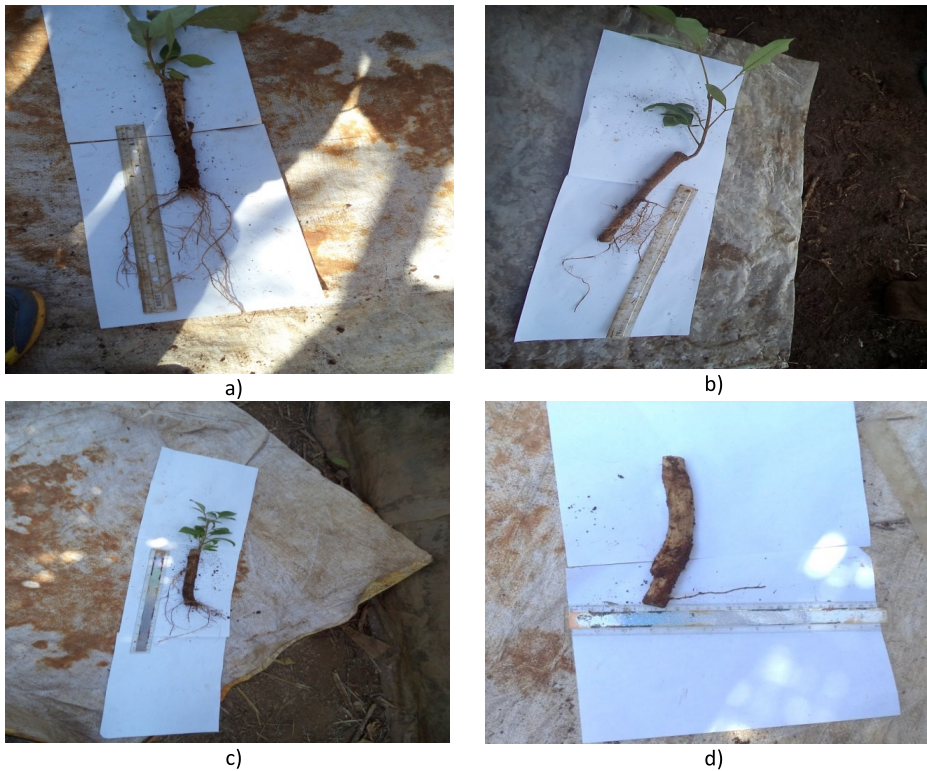
Figure 2 - Formation of roots in distal (a), median (b) and median-distal (c) poles of the RSC with leafy shoot or without (d) in V. doniana