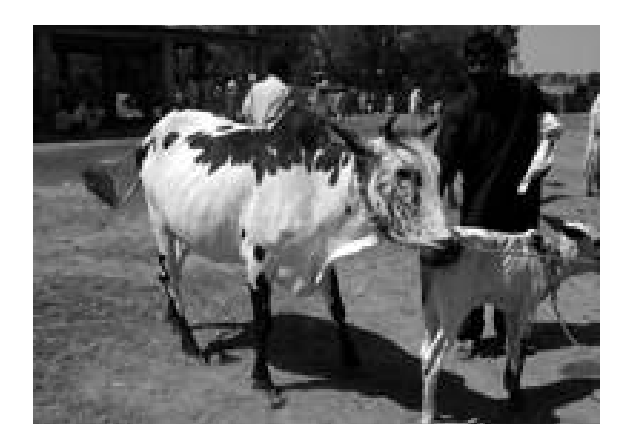
Figure 3 - Pure Dhanni cow and its calf