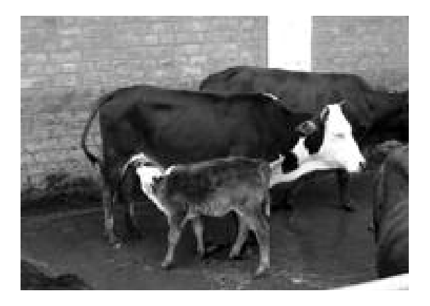
Figure 8 - The Achai breed of cattle displayed variation from the reddish color found in Swat valley to the pure black Gabrali Achai and the black with white frilly hairs on head and eyes found along the Chinese border.