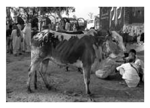
Figure 5 - Rohjani breed