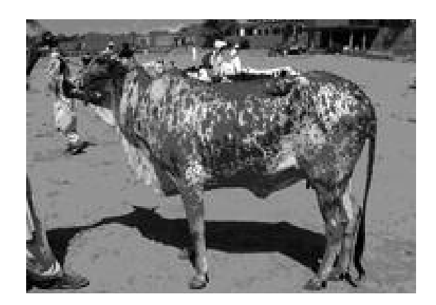
Figure 4 - Lohani breed of cattle