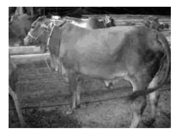
Figure 1 - Sahiwal cows at a validation centre

The Sahiwal breed of cattle are found in Punjab Province and are renowned for their heat and tick resistance and have contributed in the formation of many