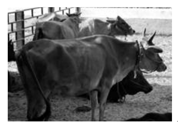
Figure 2 - Some Jersey cross cows presented at the cow centres

Semen Production Units (SPU) at various Departments of Animal Husbandry (DAH) centres in each Province and has been distributed in upgrading programs for the last 15 years (Malik Sajjad Zaheer, 2003). As evidenced in several cows some Jersey cross-breds produce the wild-type pigmentation and tended to manifest only with the dark extremities (head, neck, feet and hindquarters) while having various body colours but all their calves are consistently born with a