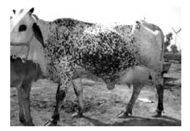
Figure 6 - Cholistani breed of cattle