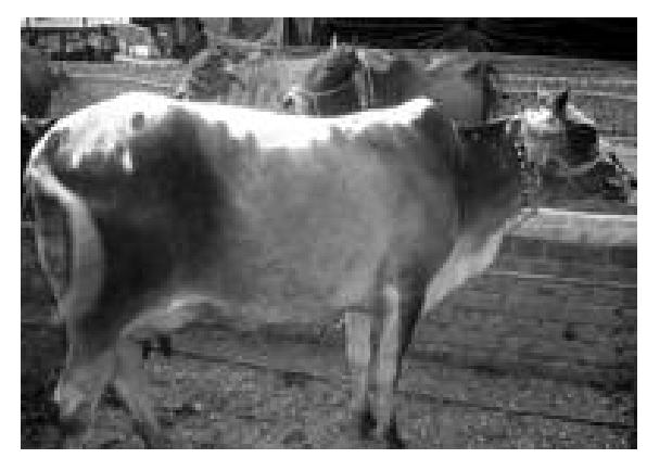
Figure 7 - Dajal cross cows showing distinct grey body coloration (these cows also have characteristic bad temperament of the Dajal).